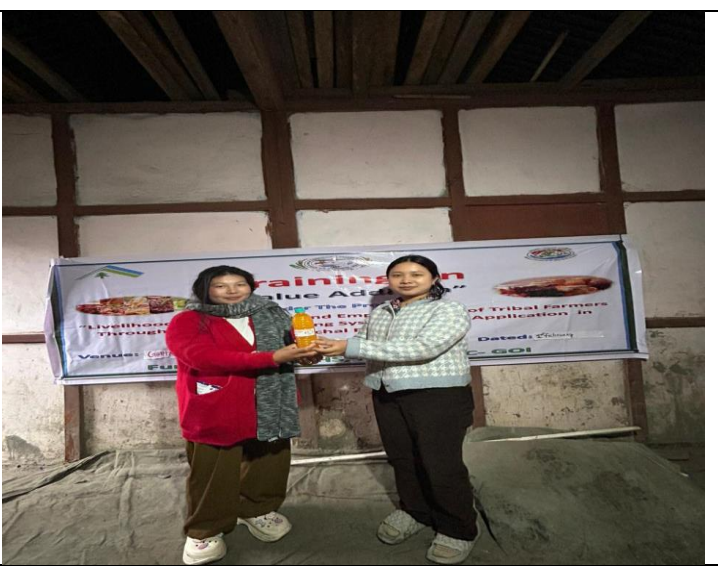
Value Addition Training: Juice Making (Orange)