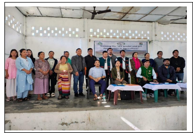
Awareness programme conducted on "ICT application in Agriculture and demonstration/ promotion of IFS model.