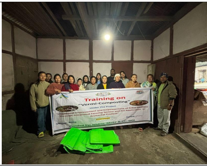
Training and Input distribution of Vermicomposting