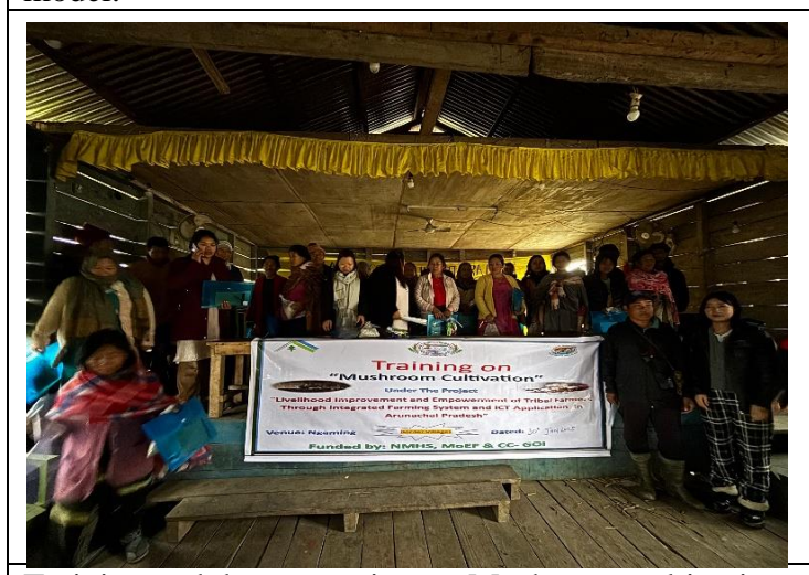
Training and demonstration on Mushroom cultivation.