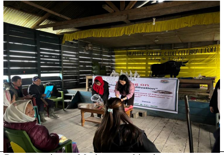
Demonstration on Mushroom cultivation