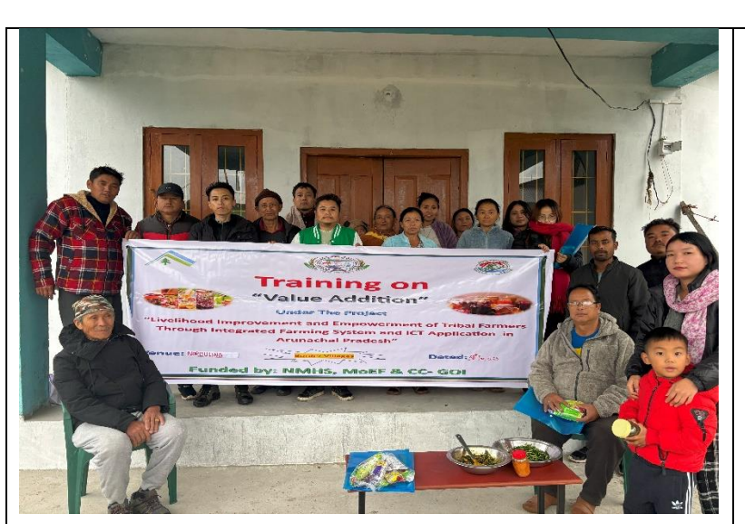
Training on Value Addition of Homemade Chilli Pickles