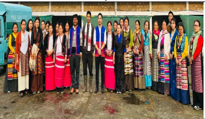
Training cum Exposure visited on IFS model and distribution of Dragon Fruit and Lemon seedlings