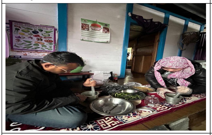
Demonstration on Preparation of Chilli Pickle.