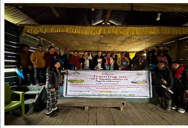
Training programme on ICT application