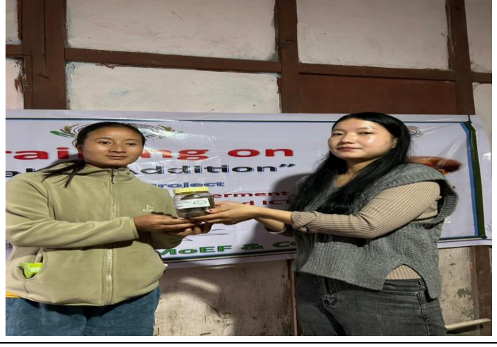
Value Addition Training : Millet Laddu